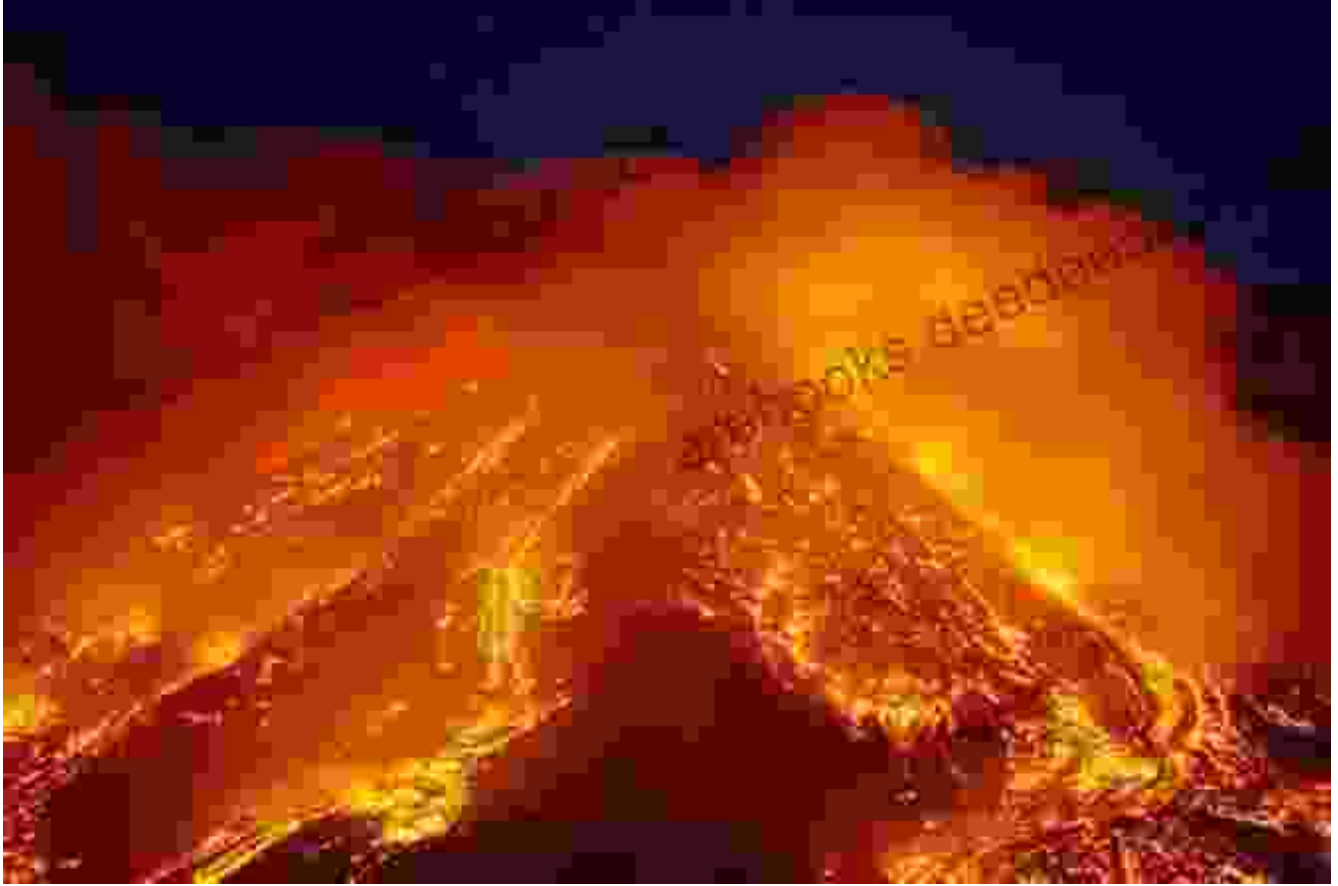
Mount Etna, Sicily