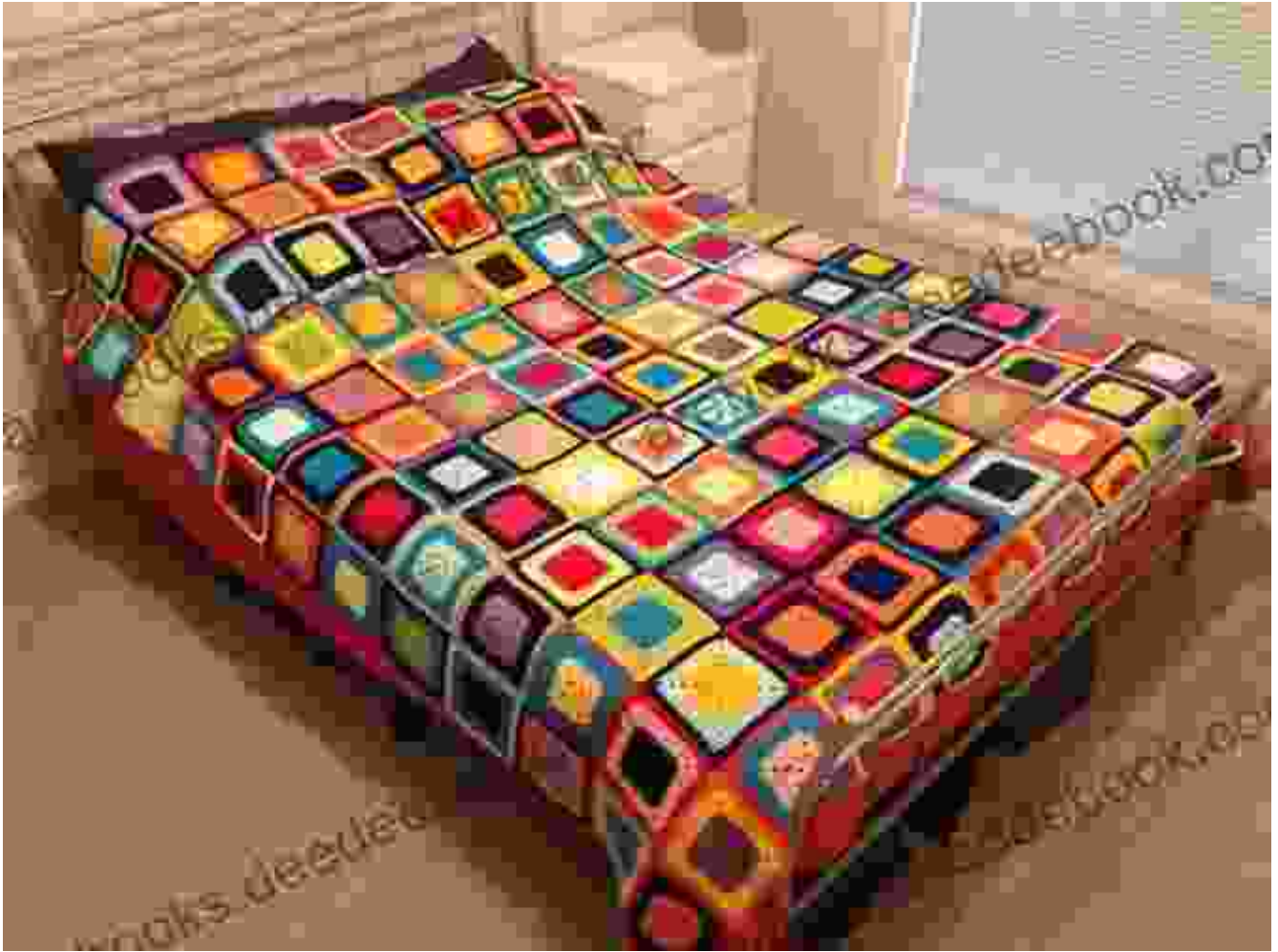
A cheerful and cozy granny square bedspread in vibrant colors, reimagined with a contemporary flair.